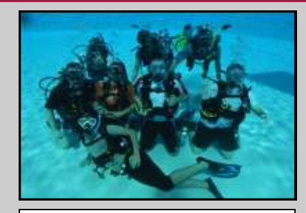
Cadets posing for a picture.

The Sun Devil Battalion started a new extra-curricular SCUBA Club this semester. In SCUBA club or "Devil Divers" we teach Cadets how to SCUBA dive and get the cadets certified to do so. We also plan dive trips to California and the Bahamas to complete their certifications and gain additional skill ratings. Our first class is near completion with only the training, written test, and check out dives remaining. The club allows cadets to interact in a non-military capacity.