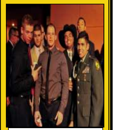
MS IVs gathering before dinner.