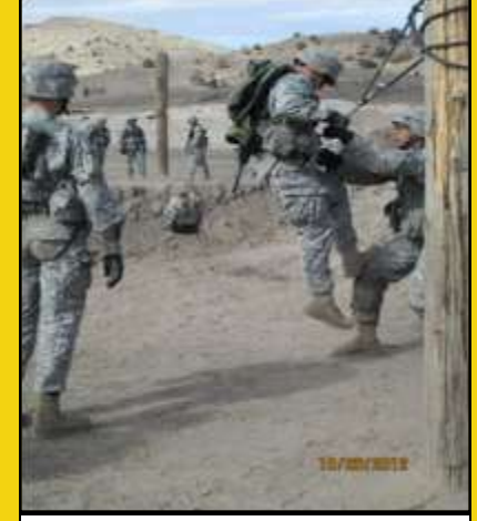
Cadets crossing rope bridge they built.

On October 20th, 2012 twenty two Cadets from ASU Army ROTC traveled to Camp Williams, UT to compete against twenty one other schools in the 13th Annual 5th Brigade Ranger Challenge. Ranger Challenge is a competition held across the country by all eight ROTC Brigades to test Cadets' proficiency in military skills such as road marching, land navigation, tactical combat casualty care, MEDEVAC procedures, marksmanship, weapons assembly and dis-assembly, and problem solving. It is a recognized varsity sport at many universities around the country and is designed to mirror the US Army's Annual Best Ranger. Competition.