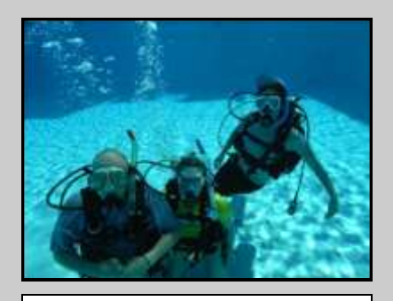
Cadets practicing SCUBA skills at the bottom of Mona Plummer Pool.